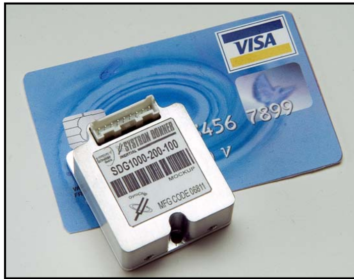
Model SDG1000 Rate Sensor